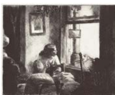
HOuseholds' energy Poverty in the EU: PERspectives for research and policies HOPPER

With the support of the Erasmus+ Programme of the European Union