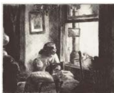
HOuseholds' energy Poverty in the EU: PERspectives for research and policies HOPPER

With the support of the Erasmus+ Programme of the European Union